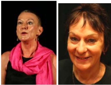
2007